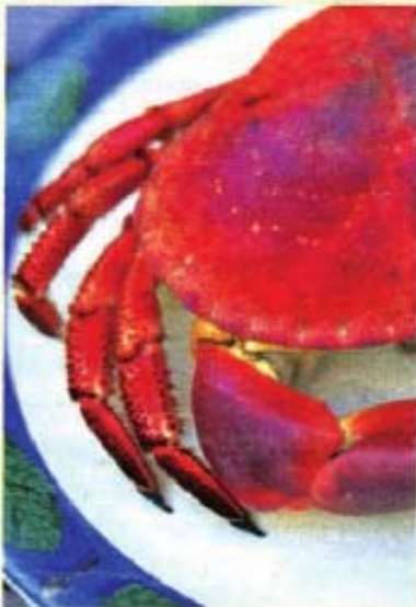
Fresh stone crab, ready for cracking.